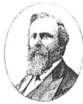
Rutherford B. Hayes